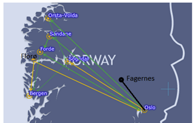
Fig. 4. The North West route area.

However, Table 6 shows that with fixed airfares and divisible