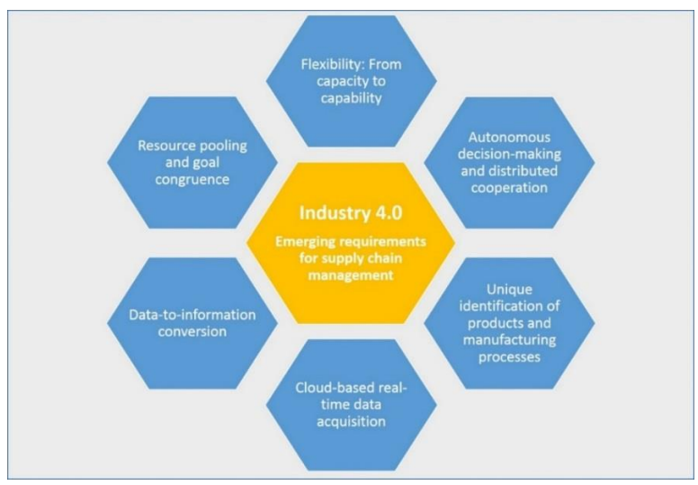
Figure 2 . Emerging requirements for supply chain management in the Industry 4.0 context.

As mentioned in the sections above, the development of technologies and ongoing conceptualization of Industry 4.0 are considered as a competitive response to fast-changing markets and customer needs in globalized manufacturing industry (Soldatos et al., 2016). This in turn can be aggregated into a set of requirements for the next generation supply chains in order to stay competitive. A brief review of Industry 4.0-related literature is used to aggregate these emerging supply chain requirements that can be addressed by use of the newest information and communication technologies and new models of management. The requirements, presented in Figure 2 will then be linked to the function of supply chain planning and, ultimately, associated with proposed key-performance indicators for controlling and improving the operational planning process itself.