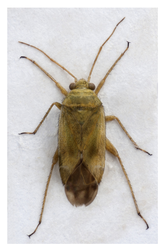
FIGURE 2 . Megalocoleus tanaceti (Fallén, 1807).