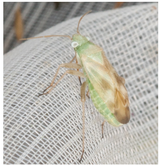
FIGURE 3 . Megalocoleus molliculus (Fallén, 1807).