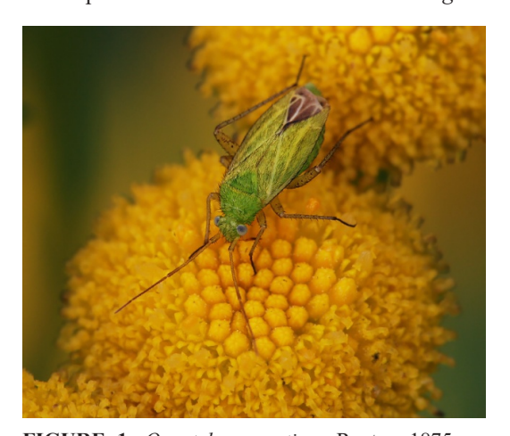
FIGURE 1 . Oncotylus punctipes Reuter, 1875 on Tanacetum vulgare L.

As can be seen from the distribution maps of M. molliculus and O. punctipes (Figures 4 and 5), the three species associated with Tanacetum vulgare