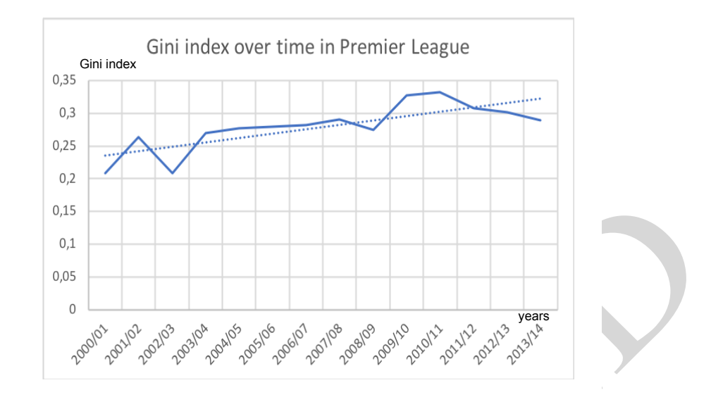
Figure 2: Development of Gini index in Premier League – 2000/01 to 2013/14 seasons

Figure 2 indicates that the Gini index is increasing over the given time period. It turns out that the linear trend shown in the figure is significant as well (at the 99% level). That is, financial inequality (measured by the Gini index) in Premier League was increasing