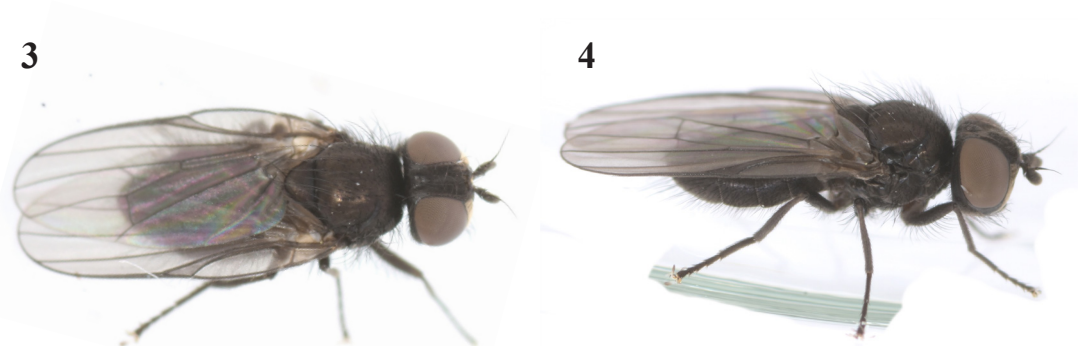
FIGURES 3–4. Earomyia lonchaeoides (Zetterstedt, 1848) 19 March 2019 at Løbbedalen 76, Neslandsvatn, Drangedal, Vestfold og Telemark. Male in dorsal and lateral views.