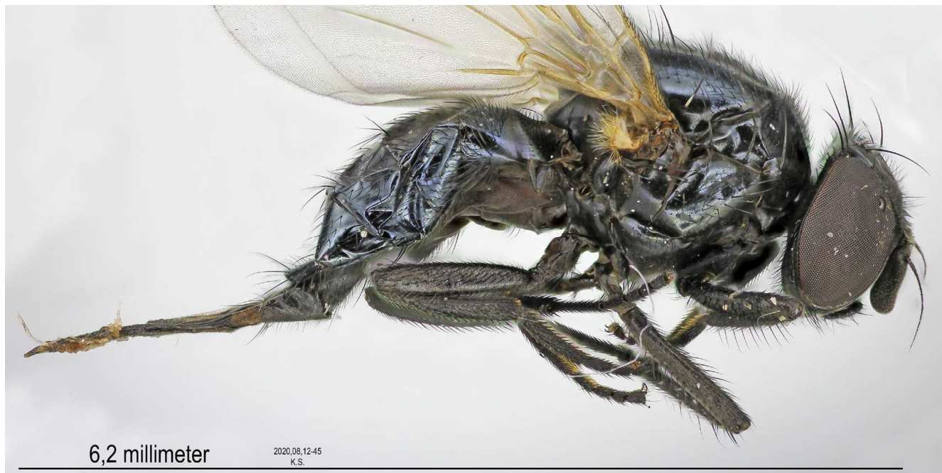
FIGURE 7. A female Lonchaea chorea (Fabricius, 1781) with extended ovipositor, from Sandnes 12 August 2020. This common species belongs to the group within the genus Lonchaea with entirely black legs and pale fringed calypteres.