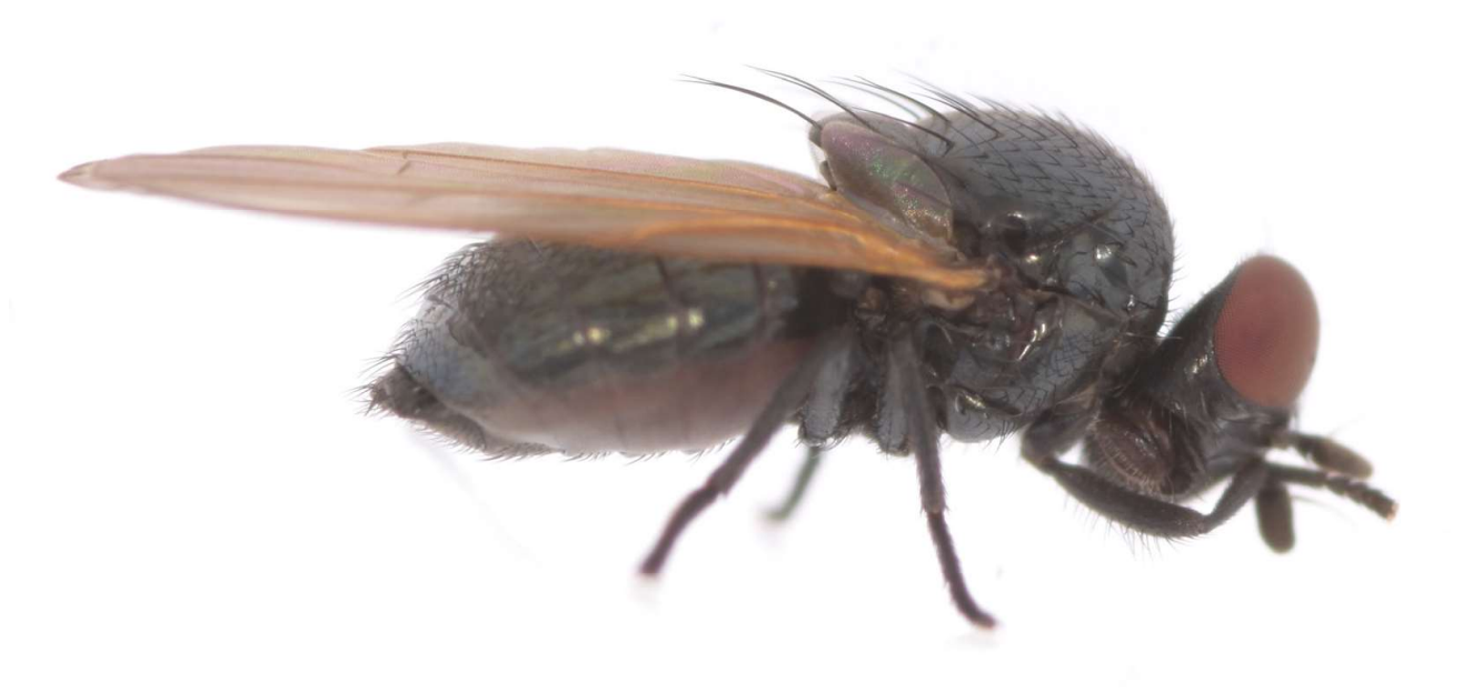
FIGURE 5. Dasiops spatiosus (Becker, 1895). The second record from Norway, a female, from Drangedal 1 August 2020.

Total: 2♂♂. Records: MRY Averøy: Rokset, Kvernesveien 1283 (EIS 84, N62.9838° E7.6693°) 1♂ 12 June 2020, netted, J.R. Gustad leg. (NMS). MRI Molde: Eikesdalen, Finnset