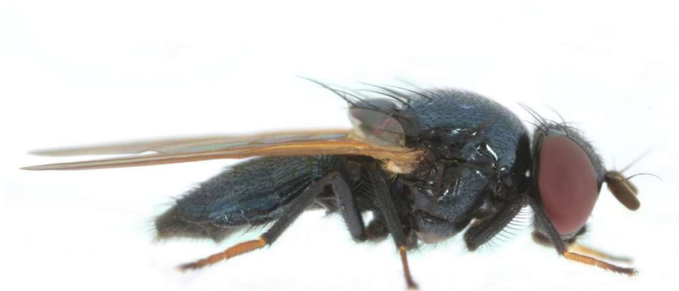
FIGURE 6. Lonchaea bukowskii Czerny, 1934. The first record from Norway, a female, from Kragerø 11 July 2020.